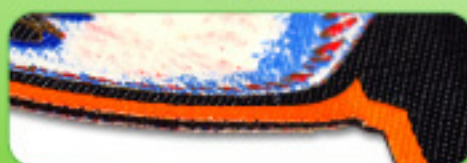
Laser Heat Cut