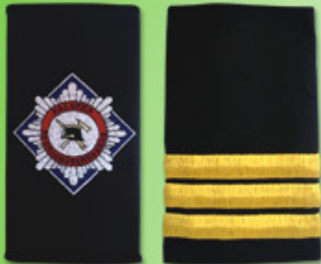
Woven / Embroidered Epaulet