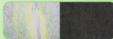
White / Black paper