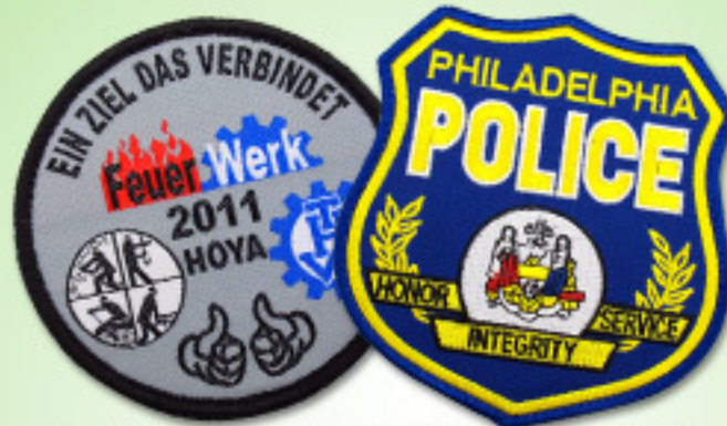
Woven / Embroidered Shoulder Patch