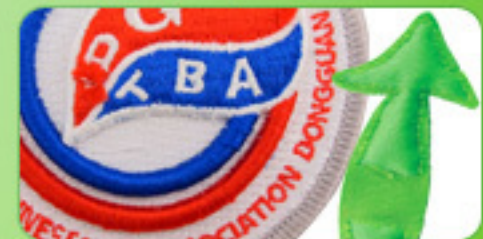
3D with EVA insert