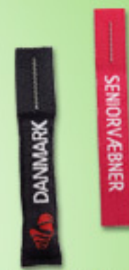
Woven Zipper puller