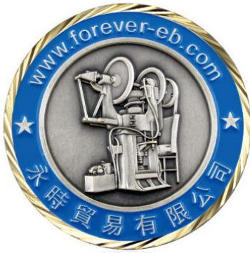
Oblique Line Edge