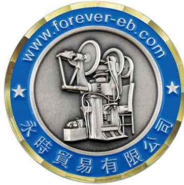
Flat Wave Edge