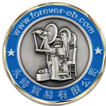
Curve Wave Edge