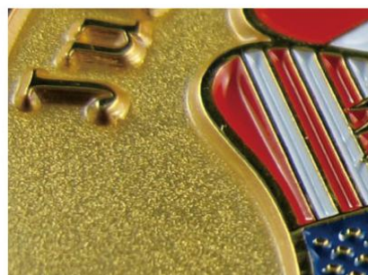
Background With Gritty and Foggy