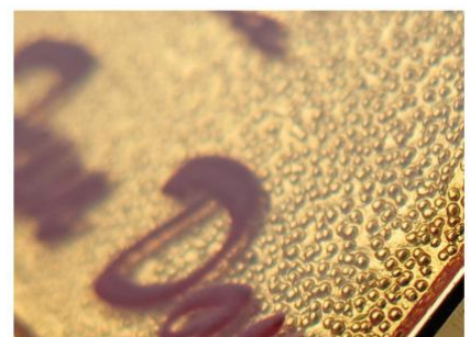
Background With Gritty