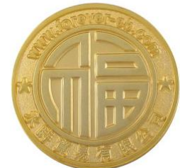
Foggy Painting Gold