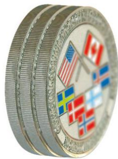
Ribbed Edge Coin