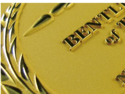
Background With Pearl Foggy Painting