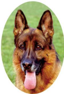
Customers' original picture