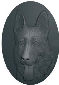
CNC 3D artwork