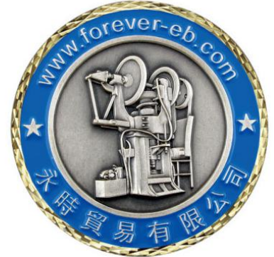
Rope Line Edge