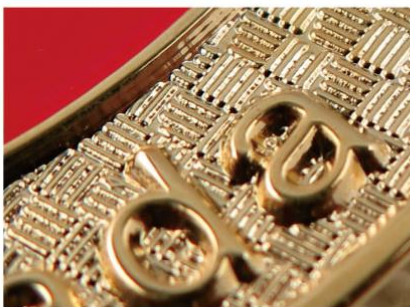
Background With Texture #10