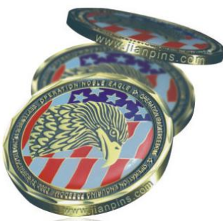
Imprint Text Edge