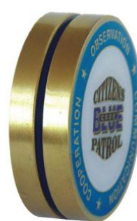
Lathed Edge Coin