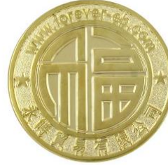
Brass Fake Gold