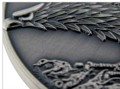
Antique Silver With Sandblasting