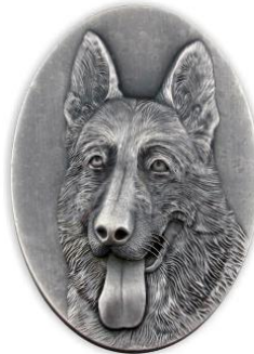
Finished 3D effect metal coin