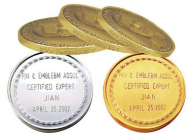
Laser Engraved Letters