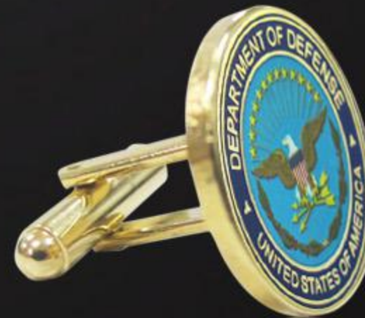
Imitation Hard Enamel with Extra Printing