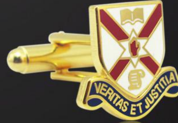
Imitation Hard Enamel